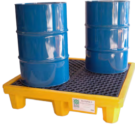
Spill containment pallets