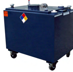
Double walled tanks