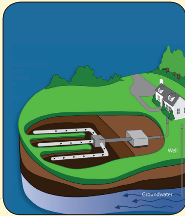
US Environmental Protection Agency

So before you buy property with a septic system, understand how septic systems work and how to tell if it has been well maintained.