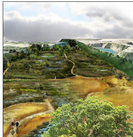
Artistic rendering of the Carli Creek Project