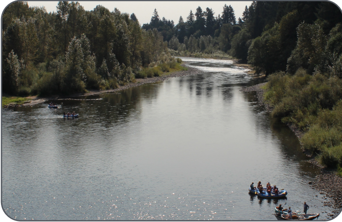
Clackamas river

The Clackamas River provides drinking water for 300,000 people, recreation for thousands, and safe harbor for endangered fish to spawn, rear and migrate. The Clackamas Basin Pesticide Stewardship Partnership (Clackamas PSP) is a voluntary, collaborative process to protect the river and its tributaries. Local and state organizations offer water quality monitoring, resources and training for landowners and managers to enable more efficient and effective pesticide use that reduces drift and runoff.