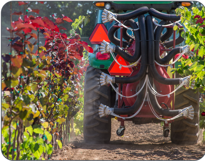
Sprayer calibration and smart sprayer technology dramatically reduces off-target pesticide loss.