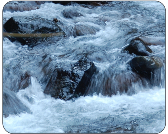
In the Hood River, the Dalles and Walla Walla watersheds, collaborative partnerships reduced concentrations of pesticides and herbicides of concern in local streams by 90%.